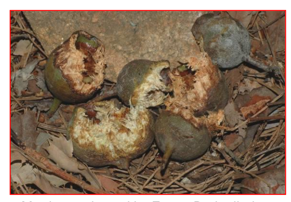
Marri nuts chewed by Forest Red-tailed Black Cockatoo