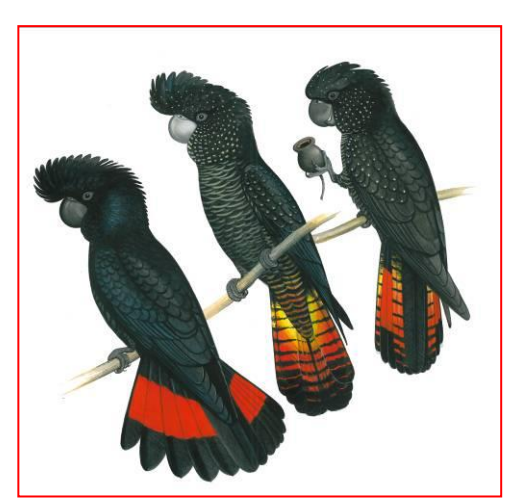
Male (left), Female (centre), Juvenile (right)